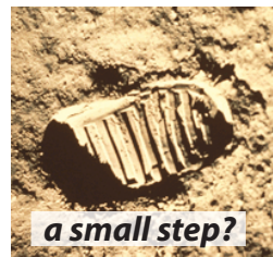
a small step?

Keshe Technologies offers licenses related to its patent pending Plasma Reactors. Plasma Reactors in several concepts and sizes for energy production , the creation of gravitational field(s) for vertical and horizontal motion replacing rocket fuel technology, the overcome of space weightlessness, magnetic shielding of spacecraft's replacing heat-shield tile, decontamination processes, production of water, oxygen, hydrogen, metals, etc., from available space atoms and molecules, production of amino acids, creation of atmospheric conditions for human space colonization and green-housing, production of nano products, various type of lighting, local powering by plasma batteries, etc.