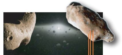
Asteroids and soil of planets become basic sources for refuel and for the intake of molecular matter that will be recombined into desired atomic or molecular matter.

Below-surface greenhouses and farms are possible since plasma reactors can deliver solar-like spectral light, although protective shielding is also possible for surface constructions. Robots can work independently from outside powering for long time on distance locations.